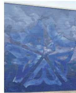
The mural of the front wall of the Edgerton R-Center now welcomes visitors with a unique take on the Rochester logo and birds taking flight on stunning shades of blues and grays.